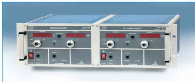
Rack adapter for two ½19" units