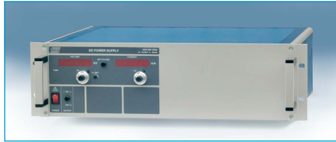
Rack adapter for a 19"- unit

For retrofitting of 19" rack adapters please state the height of the front panel!