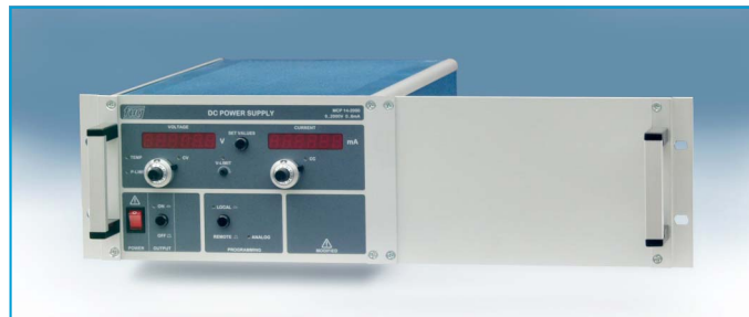
Rack adapter for a ½19" unit with ½19" blind panel